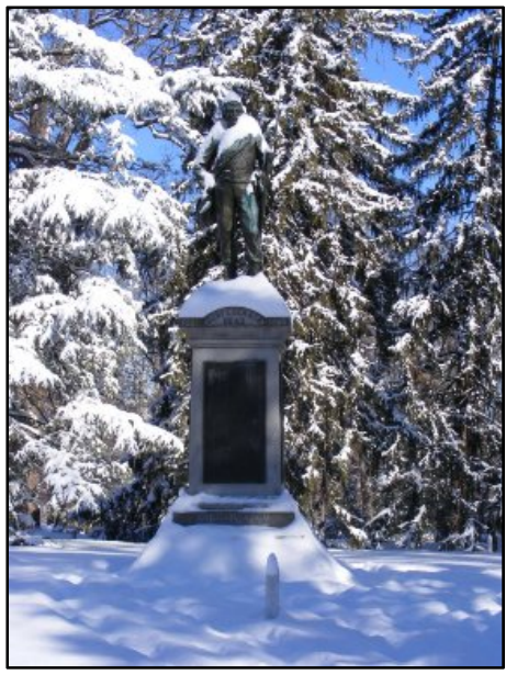
Memorial Honoring War Dead University of Virginia Cemetery