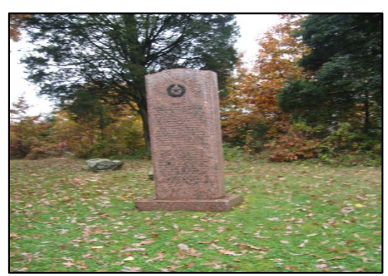
Texas State Monument, east of Emmitsburg Rd.