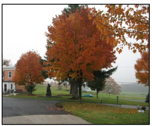
Maple Fall Foliage—Evergreen Cemetery