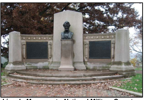
Lincoln Monument—National Military Cemetery