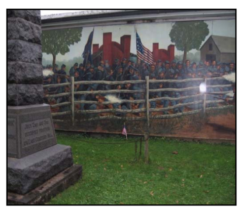
The Dunkelman (Coster Avenue) Mural at the Site of Kuhn's Brickyard, East Cemetery Hill