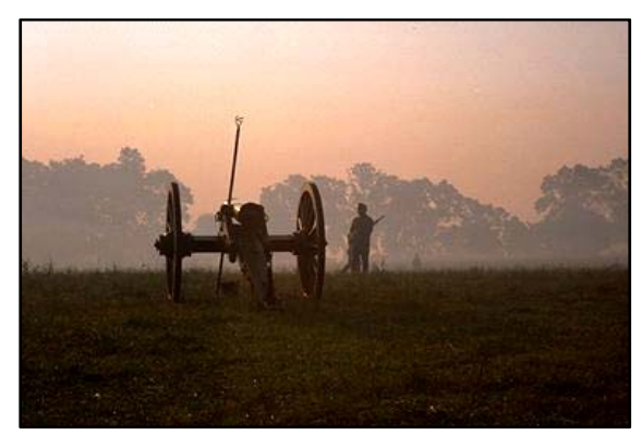
Gettysburg Reenactor and Cannonry

If you have a favorite Civil War period photo to share with your fellow Round Tablers, just email the jpeg file of your selection to your editor, and I will choose one submitted photo for each issue of future newsletters.