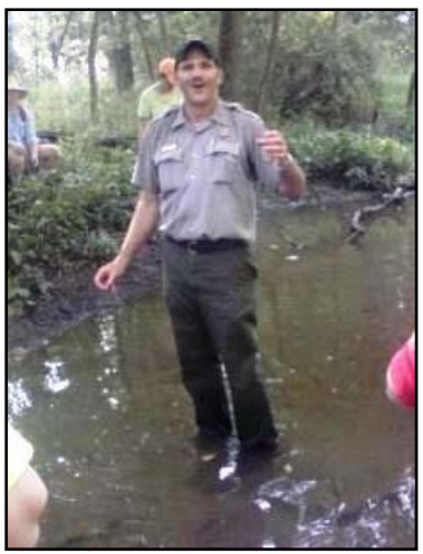
Recreating History Where it Happened

often happens in cursory lookbacks at history. His presentation will strip away those blinders and explain the battle in its logical connectedness.