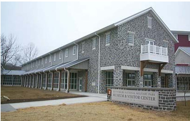
Gettysburg Museum and Visitor Center Opens 04/14/08

The Gettysburg Foundation, in partnership with the National Park Service, has opened the long-awaited Museum and Visitor Center at the Gettysburg National Military Park. The facility is designed to present a Civil War-era feel and at the same time to offer a state-of-the-art museum experience. The Center links artifacts, interactive stations, computer resource center, and archival materials in such a manner as to appeal to visitors of all ages and interests.