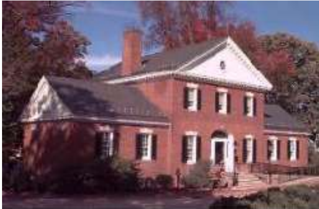
Fredericksburg Battlefield Visitor Center

If you will be joining us on the trip and have not yet made your deposit, we ask you to pay a $250 deposit at the May meeting. The second payment will be due by July 15 and the third and final payment will be due at our September meeting. If you do not commit by the due date for the July payment, I cannot guarantee you that you will receive the group rate airfare.