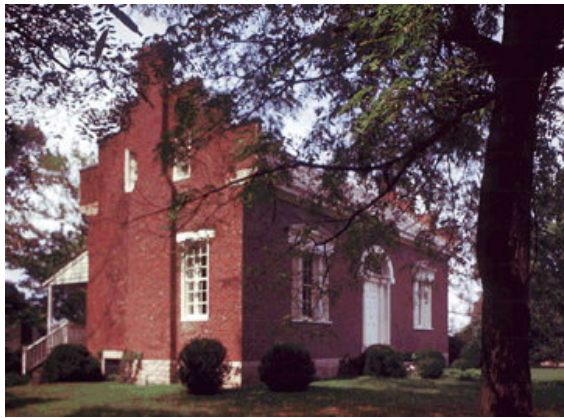
Carter House, Franklin, TN— National Historic Landmark

Constructed in 1830, the house was occupied successively by three generations of the Carter family and became the center of some of the heaviest fighting during the battle. A visit would be well worth your time.