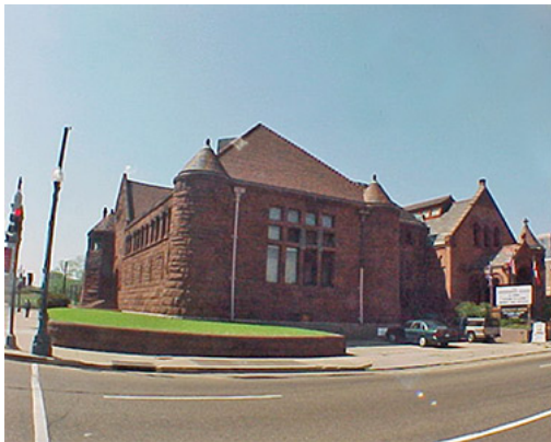
Confederate Memorial Hall, New Orleans, LA