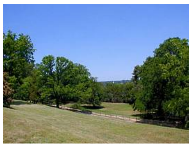
The View from Marye's Heights, Fredericksburg, Ranking Among the Foremost Landmarks in American Military History

This should be a great trip, and we hope as many of you who can will join us. I am currently accepting deposits of $250 per person. More details will be forthcoming in future editions of General Orders , so stay tuned!