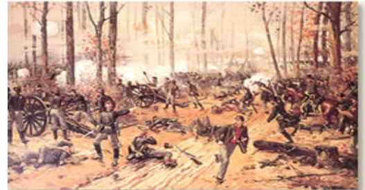
The battle at the Hornet's Nest Union troops held for 6 hours

Southern side. There were as many men killed at Shiloh as there were at Waterloo. The difference between that Napoleonic war and the American Civil War is that the former didn't involve twenty more Waterloos to come. Shiloh was indeed a decisive bat-