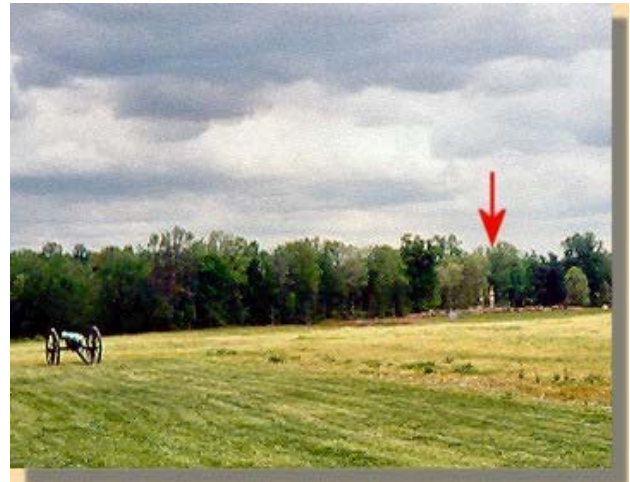
Parsonage Ruins in Broader Perspective (Red Arrow)