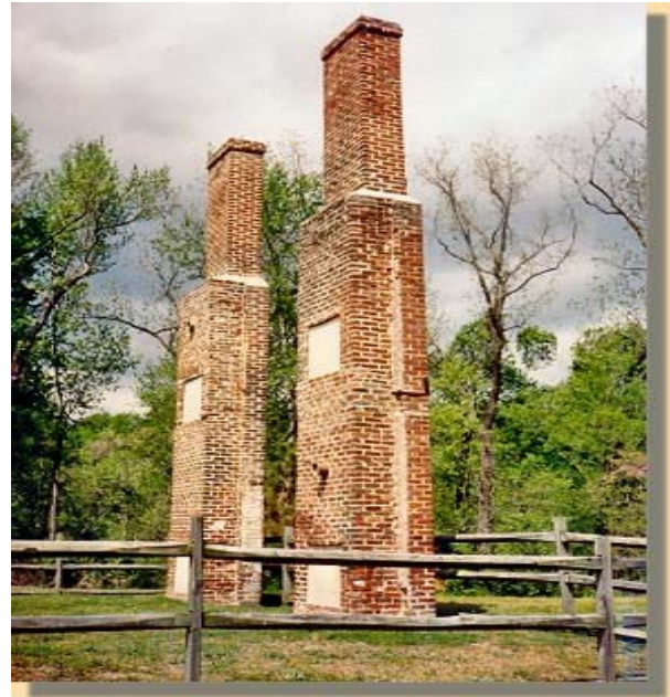
Willis Church Parsonage Remains, Malvern Hill (2005)

He is currently researching a book on the Battle of Malvern Hill and the Seven Days Campaign. We are looking forward to its release and are indeed pleased and honored to have him as our special guest speaker for our February meeting.