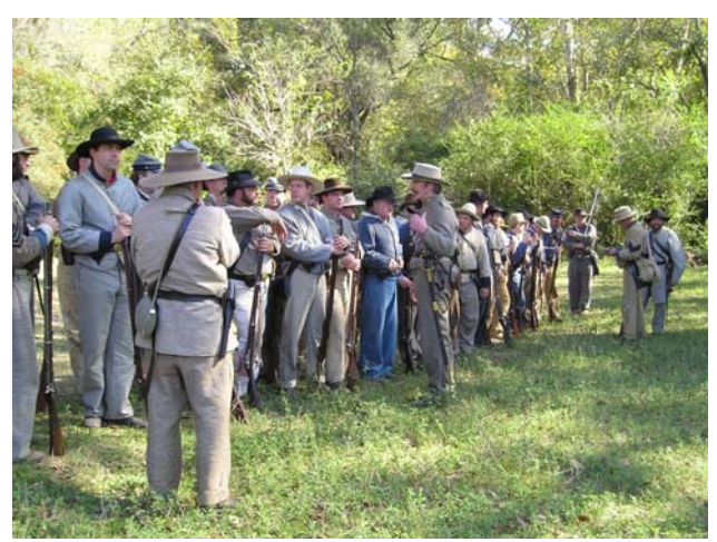
Liendo Plantation Reenactment

"Liendo Civil War Days" – November 17-28. For further information go to the website <u>www.liendo.org</u>T.