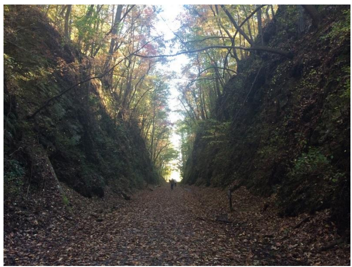
The Civil War Railroad "bed", Allatoona, GA

Peachtree Creek. We also had a brief tour of the Civil War section of the Atlanta History Center before catching our return flights. If you had gone with us, you would now understand the term "Shoupade". Besides wonderful interpretations of Civil War history, we also enjoyed the beautiful north Georgia scenery, barbeque, and other fine cuisine.