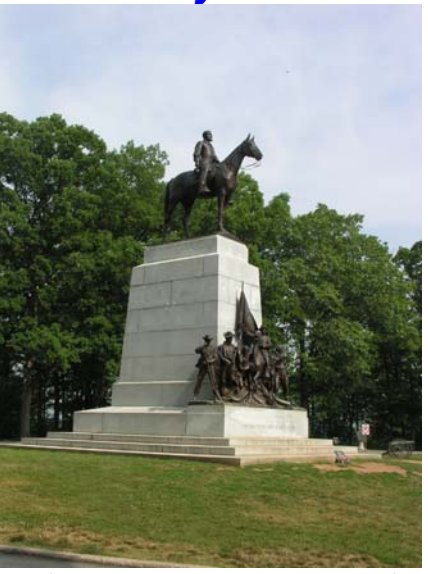
"The Virginia Monument at Gettysburg"