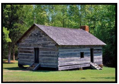
Shiloh Church – "Place of Peace"