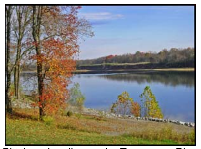
Pittsburg Landing on the Tennessee River