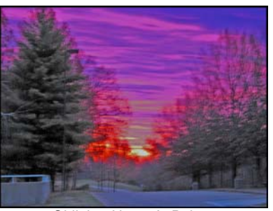
Shiloh – Nature's Palette