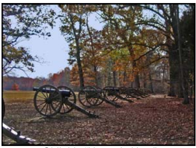
Shiloh's "Hornet's Nest'