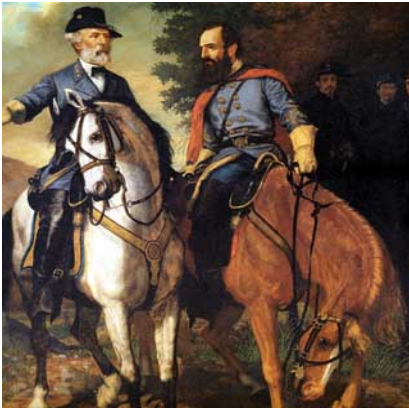
"The Last Meeting of Jackson & Lee," Battle of Chancellorsville Oil on Canvas by Everett B. D. Julio, 1864, Museum of the Confederacy

We will be journeying to Fredericksburg and Chancellorsville on October 23 -26, 2008. The itinerary includes Fredericksburg on the 24 th and Chancellorsville on the 25 th . On the 26 th , we will visit the National Museum of the Marine Corps.