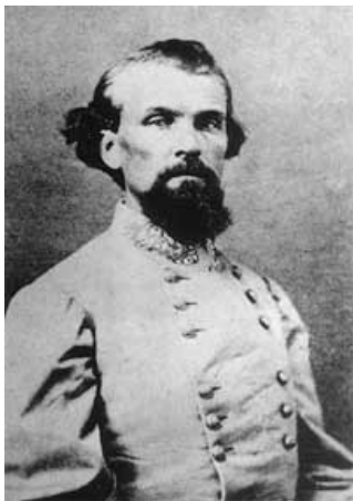
Gen. Bedford Forrest

Forrest, under pressure but seemingly unfazed by the hazardous position into which he had been thrust, ordered his horsemen to "Charge 'em both ways!" This brazen response was successful, and Forrest repelled the new threat and rushed past his astounded and demoralized enemies.