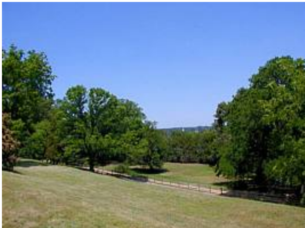
The View from Marye's Heights, Fredericksburg, Ranking Among the Foremost Landmarks in American Military History

This should be a great trip, and we hope as many of you who can will join us. I am currently accepting deposits of $250 per person. More details will be forthcoming in future editions of General Orders , so stay tuned!