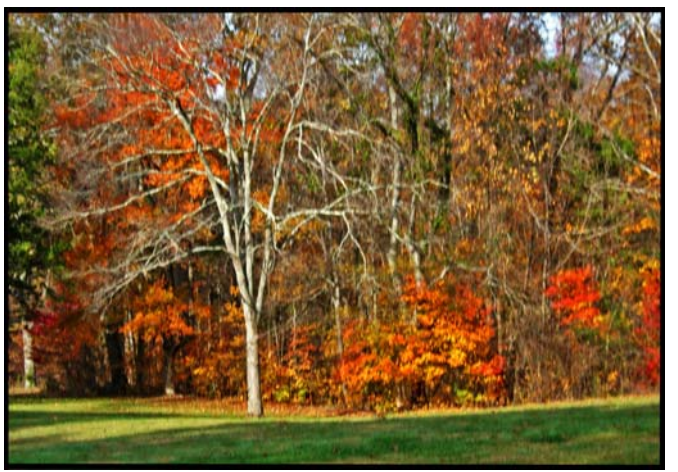
Shiloh in Autumn __A Fall Celebration of Color & Harmony

We are much indebted to Ron for these beautiful photos he is sharing with us. The battle may have been waged in the spring but the scenes and landscapes are most Inspiring when viewed in the fall.