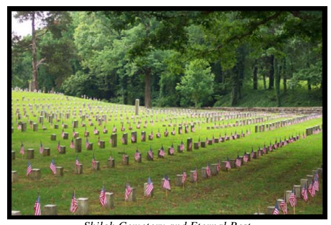
Shiloh Cemetery and Eternal Rest