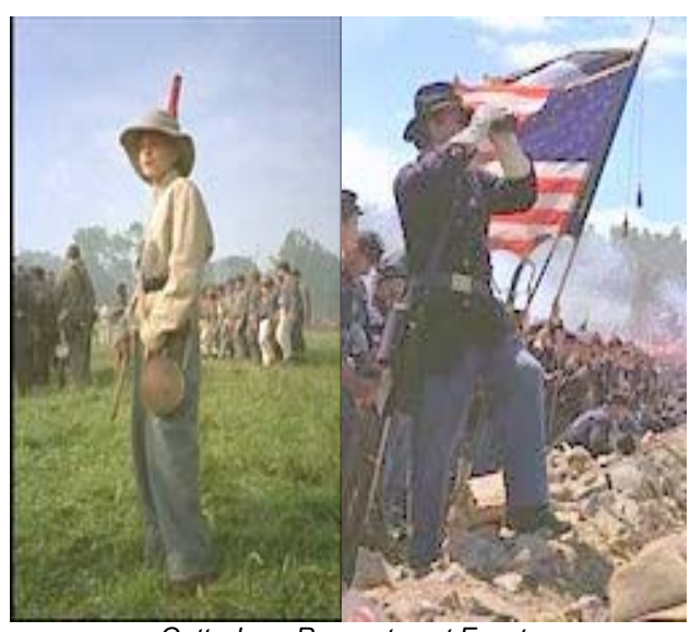
Gettysburg Reenactment Events

The second event, at Gettysburg, will encompass a reenactor march in the streets of the town to recreate the advance of Early's troops into the area in search of supplies. The Mayor and other local gentry as city officials will be participating. It will be the first time since 1863 that an organized "Confederate" army has marched along these same streets. Please see or email me for more information.