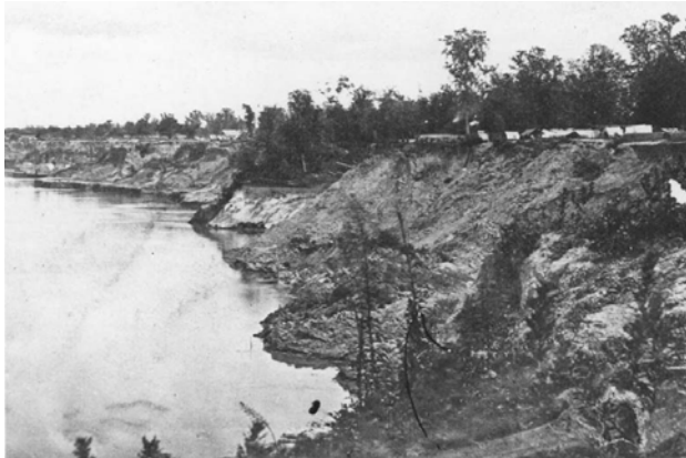
Port Hudson's 80-Foot Protective Bluffs

Local reenactors will be participating in two upcoming events at Port Hudson and Gettysburg. The Port Hudson event is scheduled for March 28-30 and Gettysburg, for July 4-6. There is a possibility that participants will be allowed to relic-hunt for spent ammunition rounds.