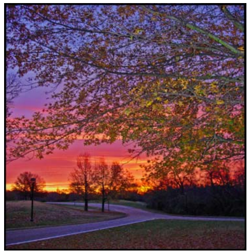
Shiloh Sunrise__Nature's Symphony

Remember, these beautiful scenes are best viewed on the emailed version of our newsletter! We will try to insert more of these photos as time and space permit.