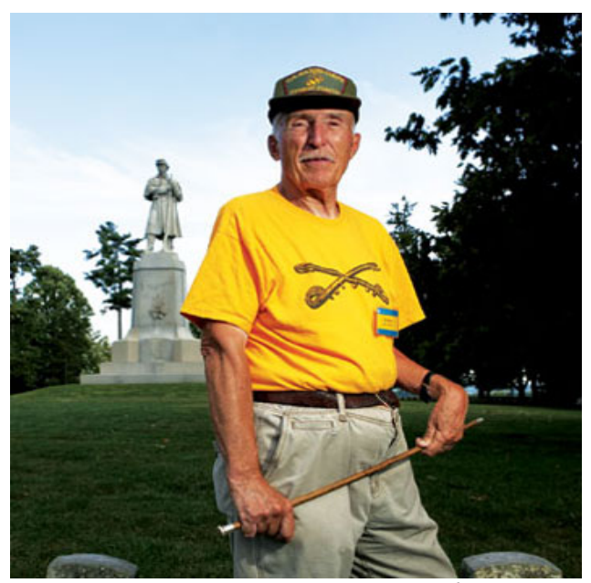
Edwin C. Bearss

Have you ever considered pivotal moments in Civil War battles—that critical decision or act which decided the issue at a particular point in time for one side or the other? Have you ever pondered the outcomes which were only made possible by such unanticipated occurrences, quick or delayed battlefield decisions, technological innovation or ingenious improvisation, broad or narrow interpretation of a commander's orders, or just plain "luck"-fortuitous happenings that perhaps no one could have predicted would ever occur at that critical moment? Have you ever wondered what character trait in this general or that ordinary soldier which had never before been tested could surface under great pressure and impel him forward to victory or spiral him downward into fear, blame, excuses, or ultimate defeat?